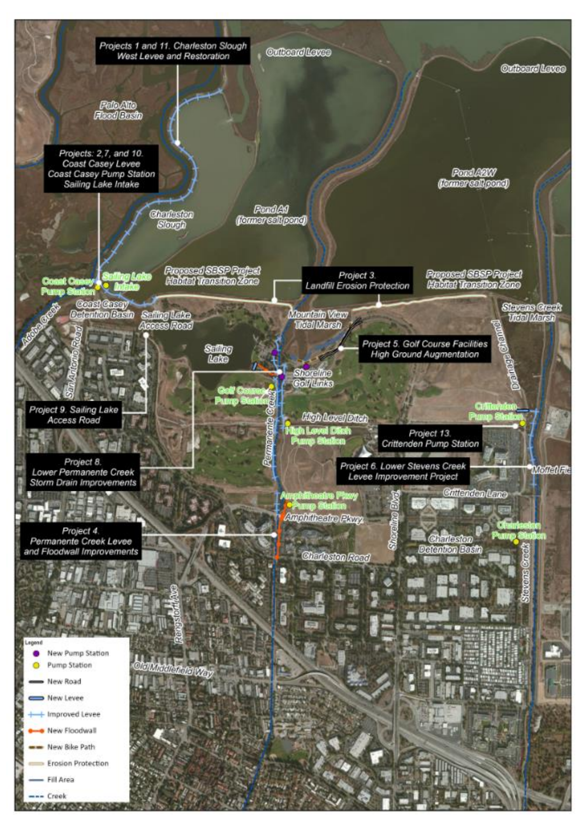
Figure 4: 2021 Sea Level Rise Capital Improvement Program Projects