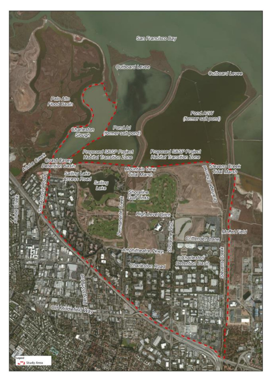
Figure 1: North Bayshore Area Map